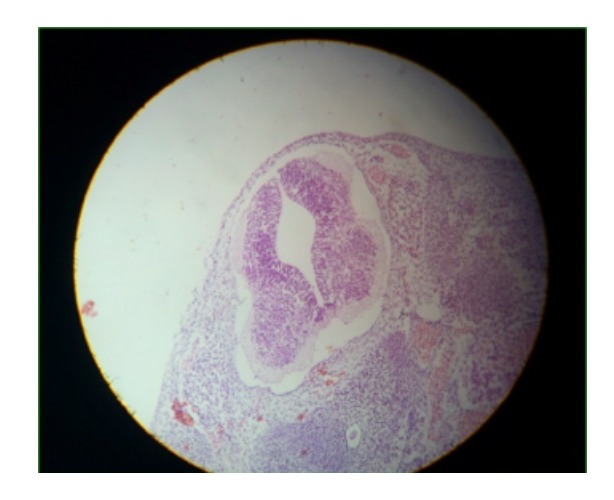
Fig2 Fetal tissue with neural plates